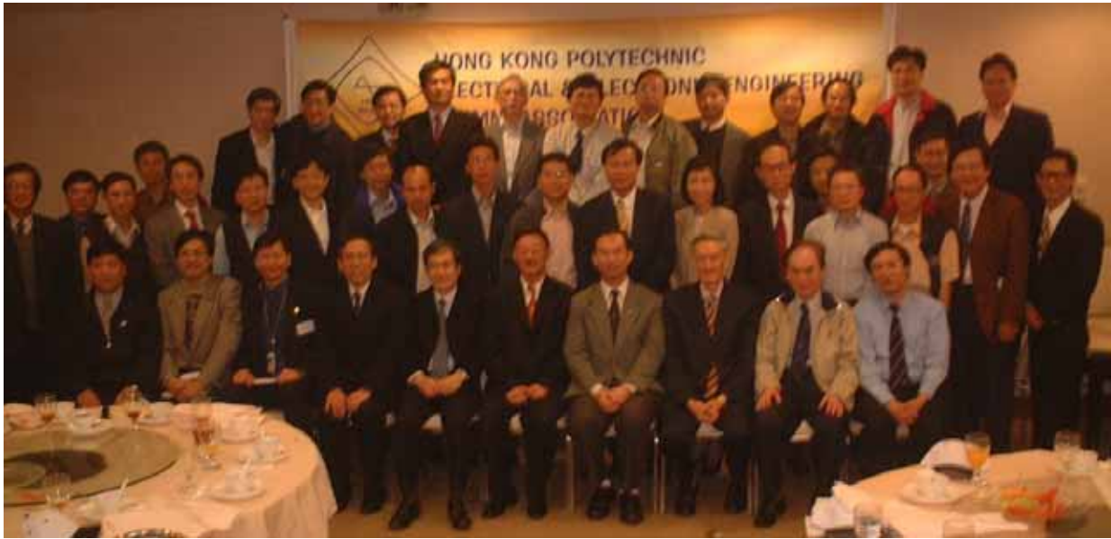
A Group photo was taken at the end of the Spring Dinner.